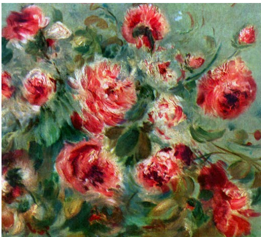
Abb. 3.01: Rosen von Vargemont - Detail (Auguste Renoir 1885) 1

Qualia are foreign objects within the natural sciences' view of the world. As early as 1882, Berlin-born physiologist and founder of experimental electrophysiology Emil du Bois-Reymond (1818-1896) declared the qualities of consciousness to be an unresolved world riddle in his lecture On the limits of our knowledge of nature :