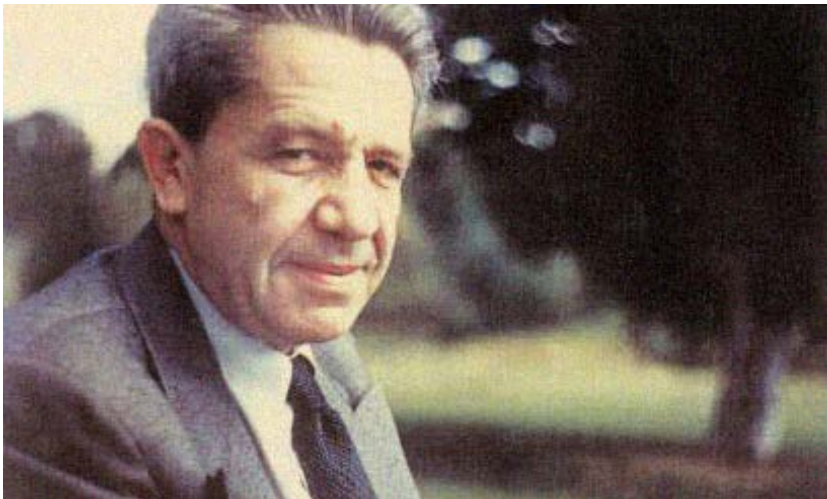
Abb. 3.03: Alfred Schütz (1899-1959) 3

The sociologist Alfred Schütz (1899-1959) utilized Husserl's phenomenological concept of the life-world to lay a theoretical foundation for the social sciences. His academic career was unusual. He studied law, economics and philosophy in Vienna and worked as a banker his entire life. He wrote his comprehensive philosophical and sociological works, the importance of which was only recognized after his death, alongside his profession. As a Jewish man, he emigrated to the US in 1938 where he achieved academic honors at the end of his life at the famous New School in New York.