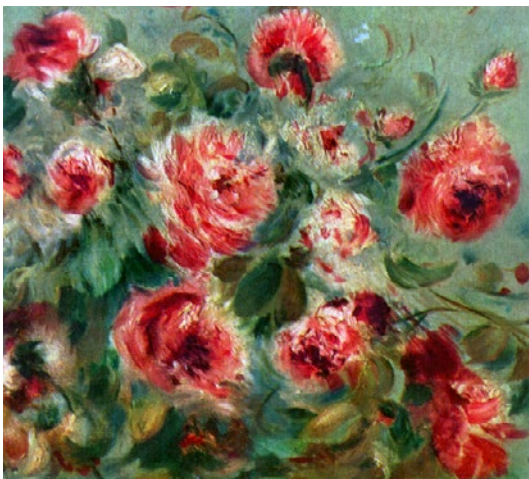
Abb. 3.01: Rosen von Vargemont - Detail (Auguste Renoir 1885) 1

Qualia are foreign objects within the natural sciences' view of the world. As early as 1882, Berlin-born physiologist and founder of experimental electrophysiology Emil du Bois-Reymond (1818-1896) declared the qualities of consciousness to be an unresolved world riddle in his lecture On the limits of our knowledge of nature :