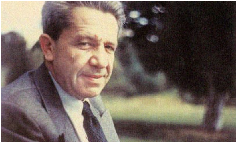
Abb. 3.03: Alfred Schütz (1899-1959) 4

The sociologist Alfred Schütz (1899-1959) utilized Husserl's phenomenological concept of the life-world to lay a theoretical foundation for the social sciences. His academic career was unusual. He studied law, economics and philosophy in Vienna and worked as a banker his entire life. He wrote his comprehensive philosophical and sociological works, the importance of which was only recognized after his death, alongside his profession. As a Jewish man, he emigrated to the US in 1938 where he achieved academic honors at the end of his life at the famous New School in New York.