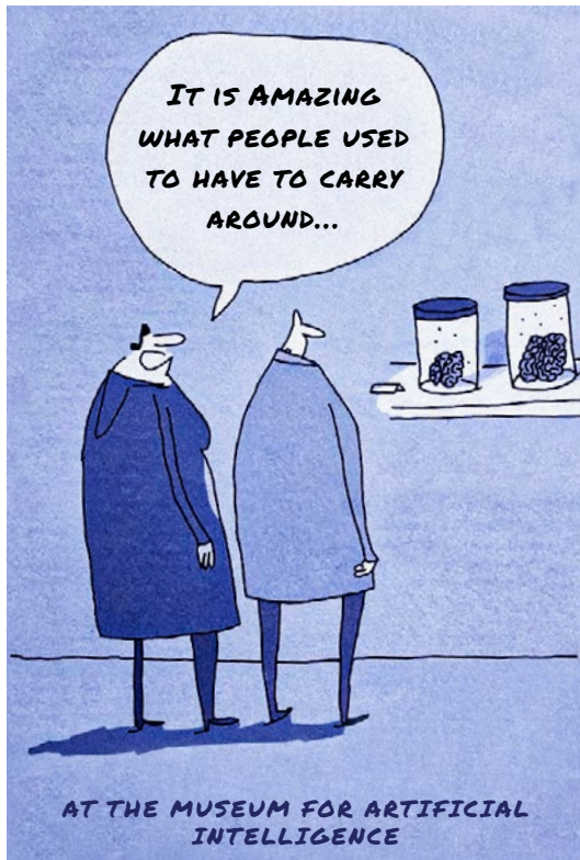
Abb. 3.02: The future of AI 2